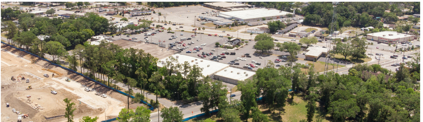
Located across from Normandy Square shopping/ Walking distance to Normandy Blvd