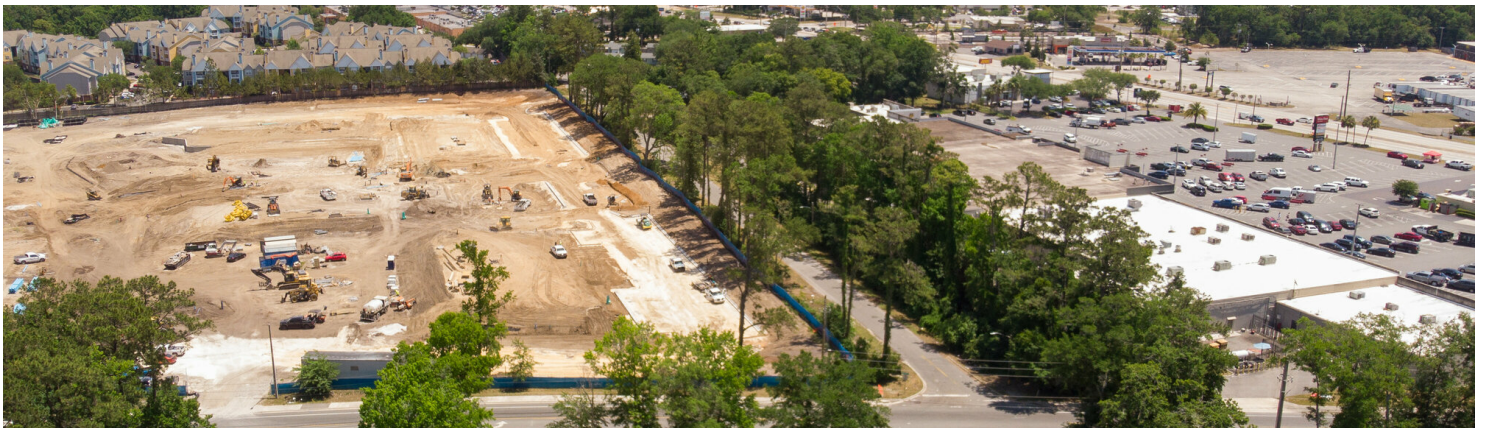
Located across from new class A apartment complex