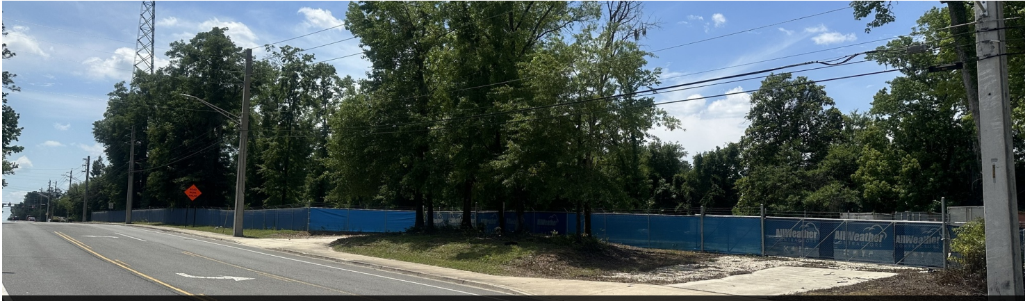
Plenty of Frontage/Fenced

1508 FOURAKER RD, JACKSONVILLE, FL 32221